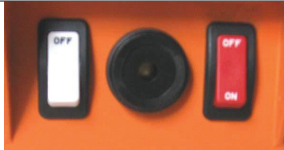
Manual Horn Beeper Run Sequence

RIGHT (Red) – press ON to initiate timing sequence. For a RULE D 3:00 PM start, press ON precisely at 2:58:50. (There is a 10 second delay before the 1 minute warning horn during which the beeper will count down seconds.)